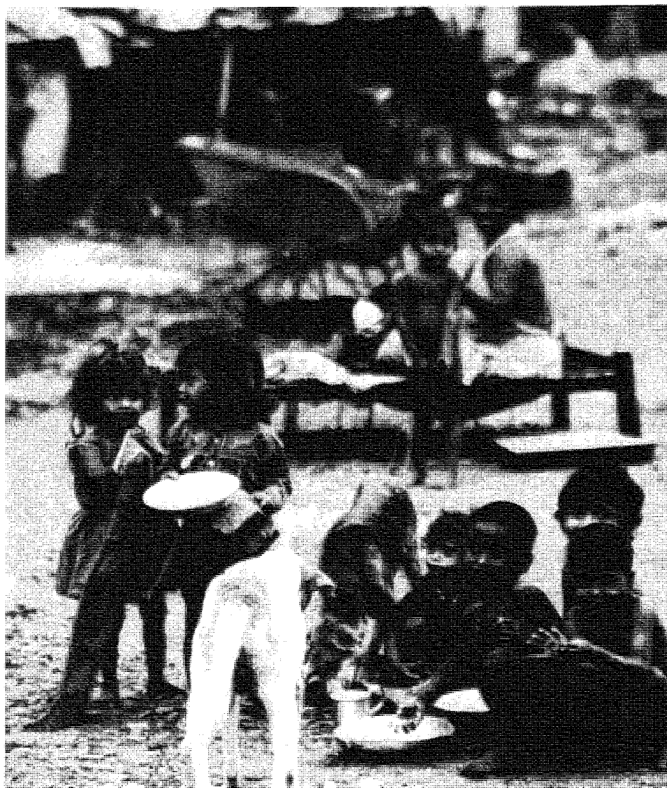
"To cut malnutrition in half for mothers and small children" is the third goal of the Bellagio Declaration. This mother and her children live in a slum in Dhaka, Bangladesh.

G oing beyond the Cold War has reversed the world's priorities, but hunger may still be the excluded middle. In 1969, I returned from two years of work in Africa to a country swept up in the turmoil of foreign war and social change, to try to use my science to address some of the great problems of human existence. "The ultimate problems of human existence," I then wrote, "are problems of mystery; the penultimate problems are of survival." I then described three, closely-linked, great penultimate problems, listing them in the order that I thought I could do something about, but what was also the reverse of their importance in the great scheme of things.